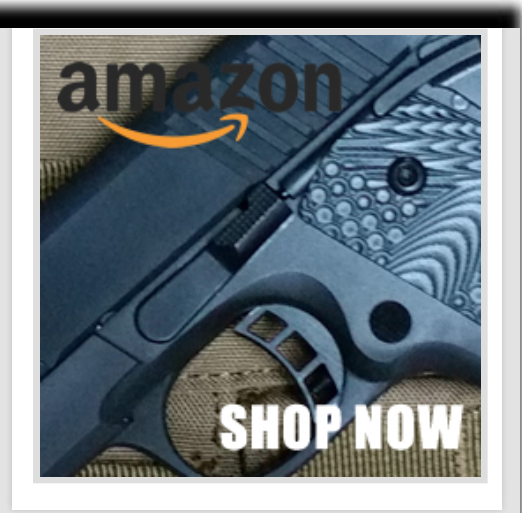
Taurus 1911 45 ACP Commander

The Taurus 1911™ .45 ACP Commander with its 8+1 capacity, has a shorter profile than traditional full size 1911's with its 4.2" barrel but maintains a full size grip providing a positive grip purchase, making it perfect for carry, self defense or home use. The pistol features a monochromatic black on black finish, Novak® drift adjustable front and rear sights, checkered black grips and extended beavertail that offers comfortable shooting with great control. The Commander is easily customized as it is built with industry standard components.