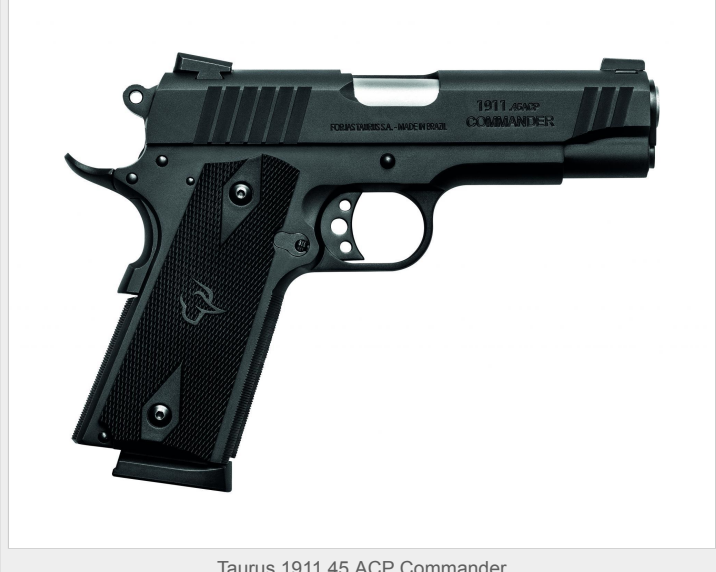
Taurus 1911 45 ACP Commander